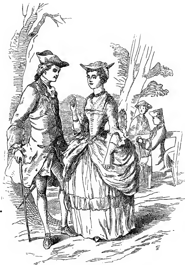
A Lay Sermon.